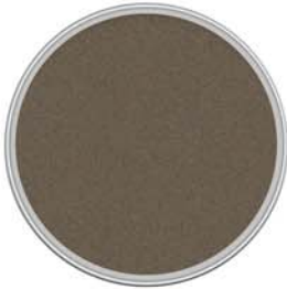
Desert Sand (2067)