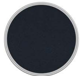
Midnight Blue (2205)

Note: Color charts are printed approximations--actual colors may vary. Please contact AJW to request a sample.